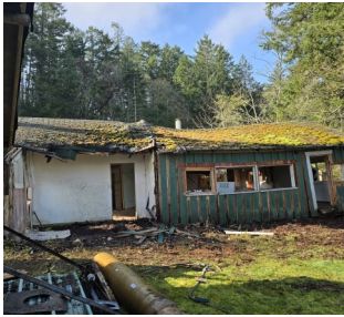
This was the Orchard 'Cottage' in it's final days.

In the last issue, I mentioned ( ranted ) about the regulatory and permitting issues surrounding this project. I didn't go into a lot of detail about it because I'd mentioned it in the issue before that, however, I got a lot of questions about why we were doing this, so here I'll present a little re-cap.